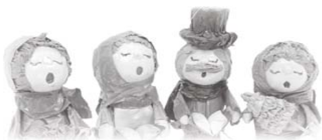
Caroling for HOPE

THE SHELTER REQUESTS THE FOLLOWING: NO ALCOHOL-BASED PRODUCTS (PERFUMES, MOUTHWASH, ETC.) ALSO, NO GUM OR CANDY IN GIFTS. NO GLUES OR SHARP SCISSORS MIRRORS OR GLASS ITEMS, PERMANENT MARKERS, PAINTS OR PLAYDOUGH.