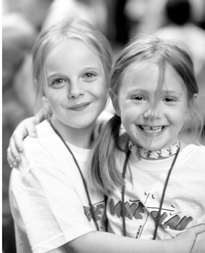
A BIG part of God's "Game Plan" in 2014 was UW Sports Camp.

HOT DOG SUPPERS: Families gathered in the kitchen to assemble 100 sack suppers and then loaded everything up to head to Rolling Green Apartments where we ate, hung out, and played with one another while inviting all to join us.