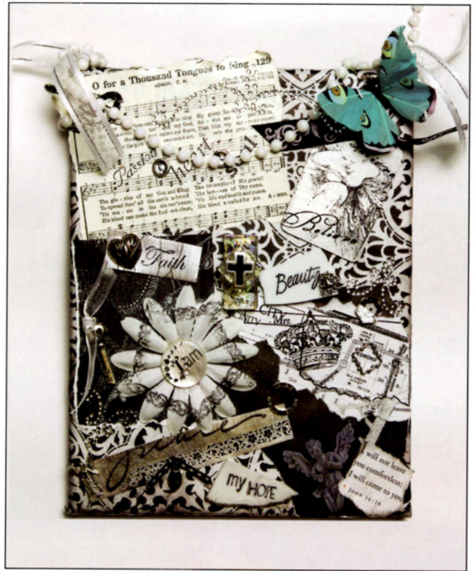
This black & white collage was intended to provide encouragement & comfort to a friend who was in mourning.