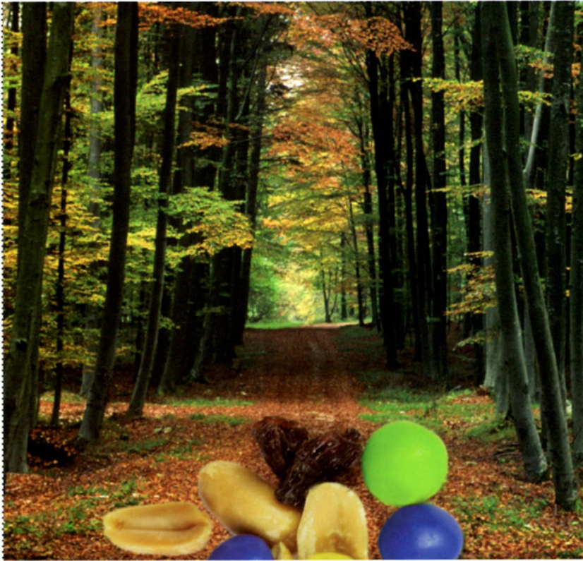
table of contents FALL 2010