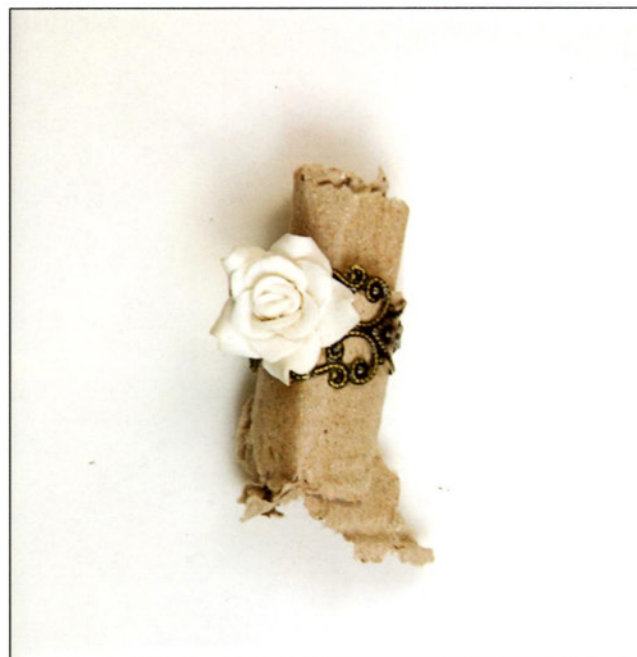
“Innocent White Rose”

I first made jewelry for my Journey group at the end of the school year. My group prompted me to make the necklaces and sell them. I didn't pay attention to them at the time because I didn't want to sell anything.” A few months later, I received a newsletter from the Voice of The Martyrs Ministry. I read about a Pakistani family who were thrown into jail simply for owning a clock in their kitchen with a picture of Christ's face on it. It touched me deeply to hear about people around the world who are being persecuted for their faith.