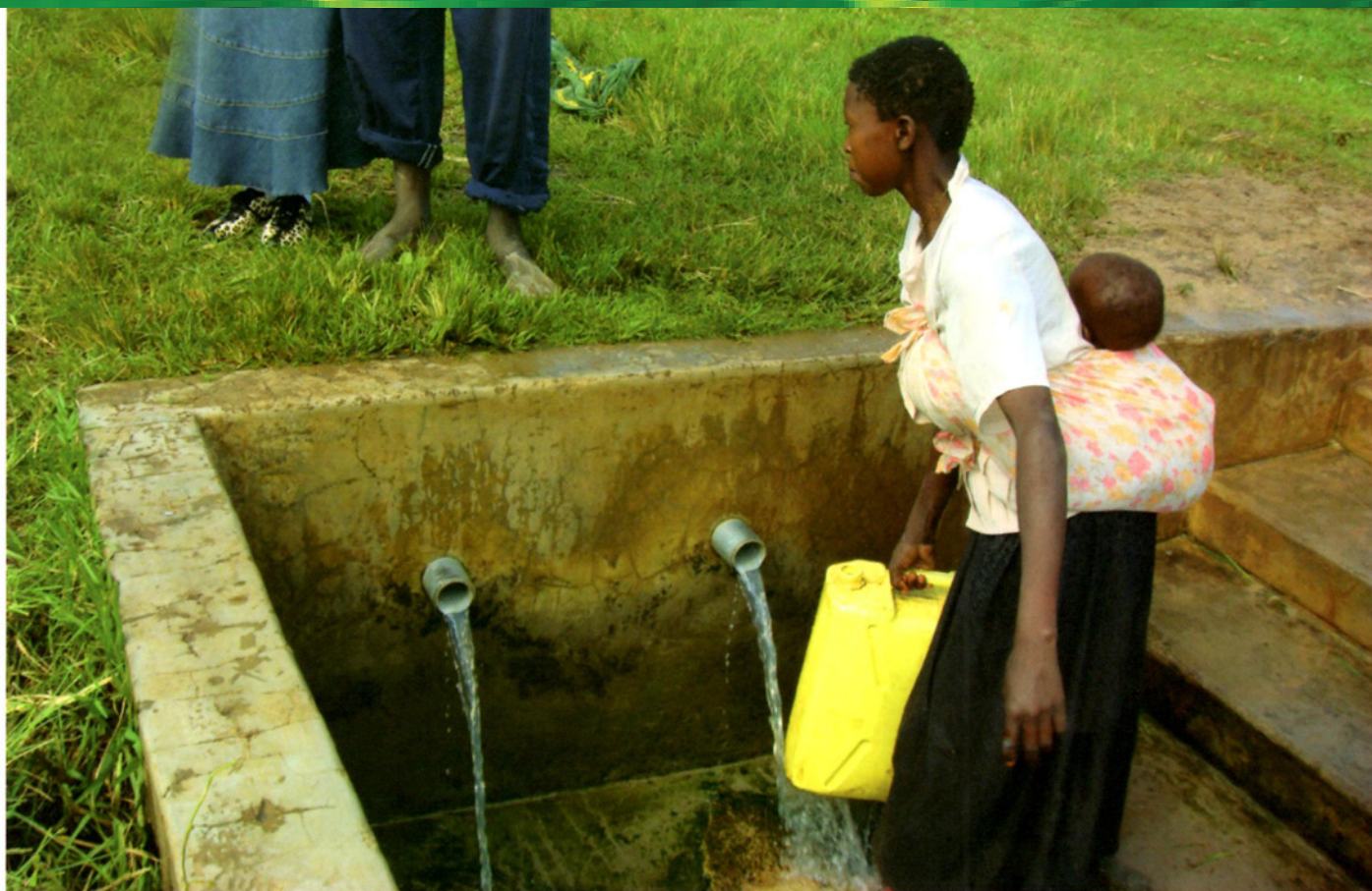
Ugandan woman from a village nearby draws water from one of the wells.

meet the people and tell them the good news of Jesus! Each afternoon there will be singing, testimonies, preaching, and the Jesus Movie on the new church grounds. This event is called the "Great Crusade." Several days during this weeklong canvas there is a free medical clinic in the church. By Sunday, the new church is dedicated and the new pastor installed witnessed by hundreds of new believers.