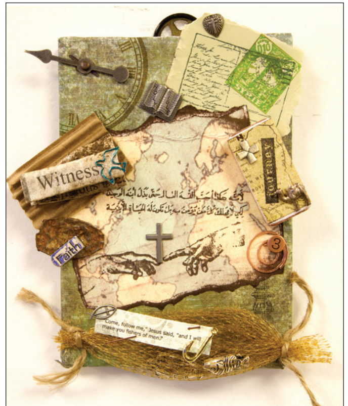
"Fishers of Men"